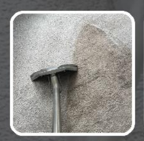
Carpet & Rug Cleaning