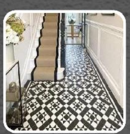
Stone and Tile Restoration